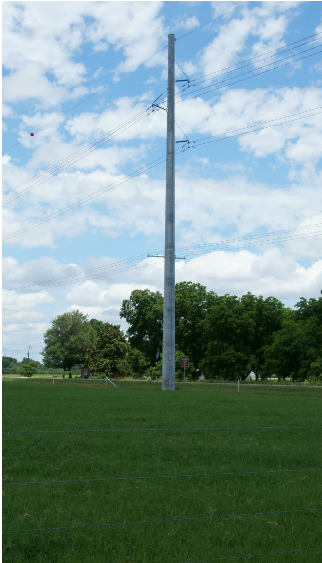
Existing structure on Hwy 50 near CR 227